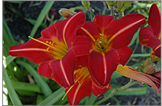
Chicago Fire Daylily flowers