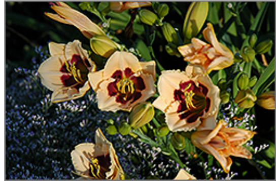
Dark Circle Daylily flowers