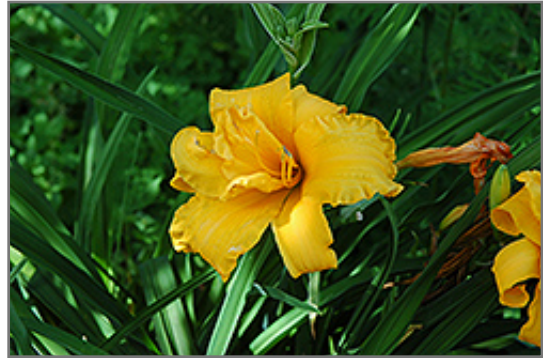
Lady Florence Daylily flowers