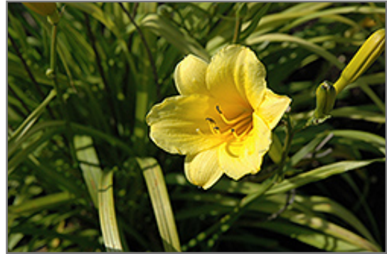
Pennysworth Daylily flowers