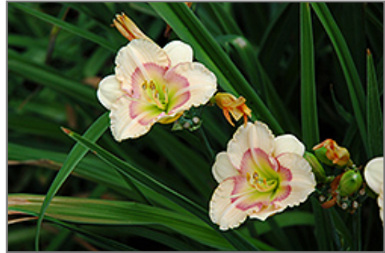
Siloam Baby Talk Daylily flowers