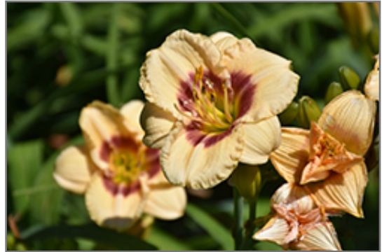
Siloam Peewee Daylily flowers