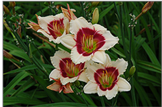
Siloam Shocker Daylily flowers