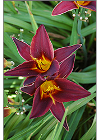
Starling Daylily flowers