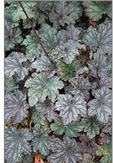
Frosted Violet Coral Bells foliage

This is a relatively low maintenance plant, and should be cut back in late fall in preparation for winter. It is a good choice for attracting hummingbirds to your yard. It has no significant negative characteristics.