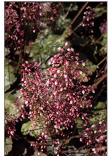
Frosted Violet Coral Bells flowers