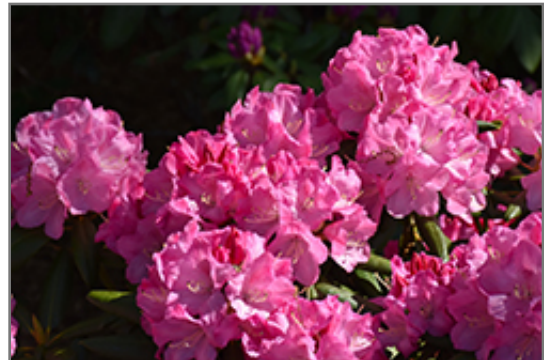
Dandy Man Pink Rhododendron flowers