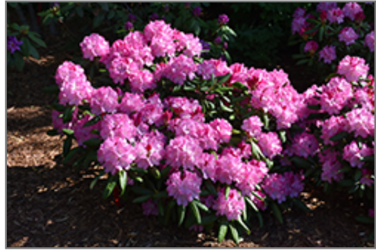
Dandy Man Pink Rhododendron in bloom

This shrub does best in full sun to partial shade. You may want to keep it away from hot, dry locations that receive direct afternoon sun or which get reflected sunlight, such as against the south side of a white wall. It requires an evenly moist well-drained soil for optimal growth, but will die in standing water. It is very fussy about its soil conditions and must have rich, acidic soils to ensure success, and is subject to chlorosis (yellowing) of the foliage in alkaline soils. It is somewhat tolerant of urban pollution, and will benefit from being planted in a relatively sheltered location. Consider applying a thick mulch around the root zone in winter to protect it in exposed locations or colder microclimates. This particular variety is an interspecific hybrid.