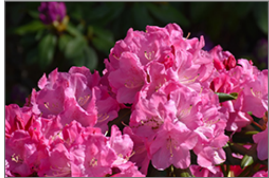
Dandy Man Pink Rhododendron flowers

Dandy Man Pink Rhododendron is recommended for the following landscape applications;