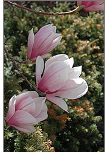
Saucer Magnolia flowers