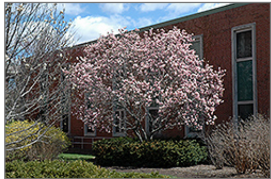
Saucer Magnolia in bloom