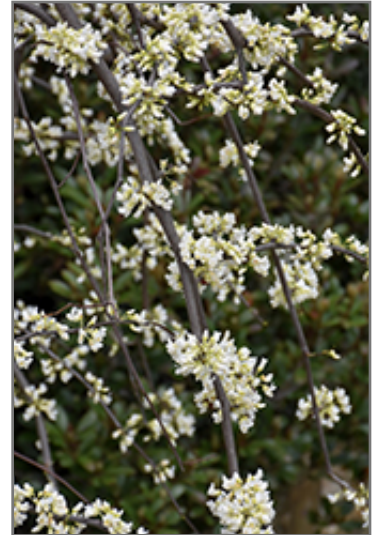
Vanilla Twist Weeping Redbud flowers

This shrub does best in full sun to partial shade. It prefers to grow in average to moist conditions, and shouldn't be allowed to dry out. It is not particular as to soil type or pH. It is highly tolerant of urban pollution and will even thrive in inner city environments, and will benefit from being planted in a relatively sheltered location. Consider applying a thick mulch around the root zone in winter to protect it in exposed locations or colder microclimates. This is a selection of a native North American species.