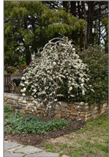
Vanilla Twist Weeping Redbud in bloom

Vanilla Twist Weeping Redbud is recommended for the following landscape applications;