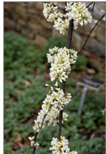
Vanilla Twist Weeping Redbud flowers