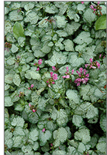
Beacon Silver Spotted Dead Nettle flowers