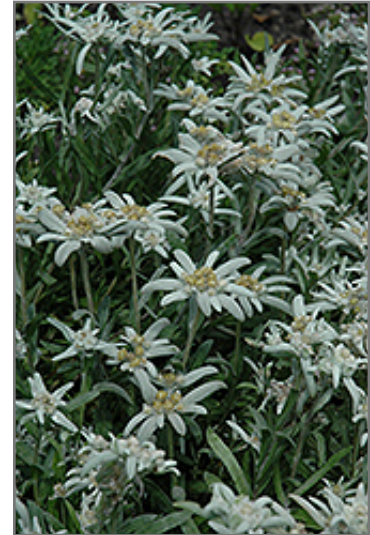
Alpine Edelweiss flowers

This plant does best in full sun to partial shade. It prefers dry to average moisture levels with very well-drained soil, and will often die in standing water. It is considered to be drought-tolerant, and thus makes an ideal choice for a low-water garden or xeriscape application. It is particular about its soil conditions, with a strong preference for poor, alkaline soils. It is somewhat tolerant of urban pollution. This species is not originally from North America. It can be propagated by division.