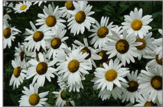
Alaska Shasta Daisy flowers