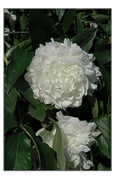
Rose Marie Lins Peony flowers

Rose Marie Lins Peony will grow to be about 30 inches tall at maturity, with a spread of 3 feet. When grown in masses or used as a bedding plant, individual plants should be spaced approximately 30 inches apart. The flower stalks can be weak and so it may require staking in exposed sites or excessively rich soils. It grows at a slow rate, and under ideal conditions can be expected to live for approximately 20 years. As an herbaceous perennial, this plant will usually die back to the crown each winter, and will regrow from the base each spring. Be careful not to disturb the crown in late winter when it may not be readily seen!