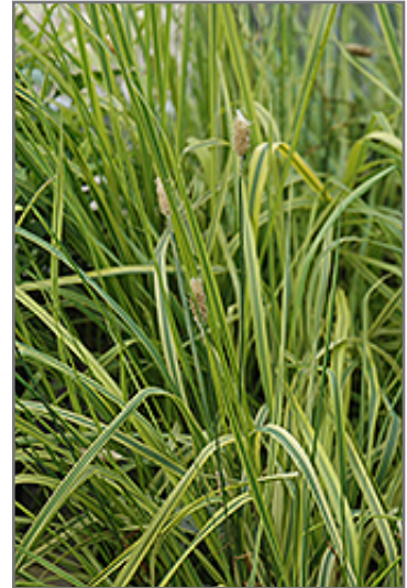
Variegated Foxtail Grass foliage