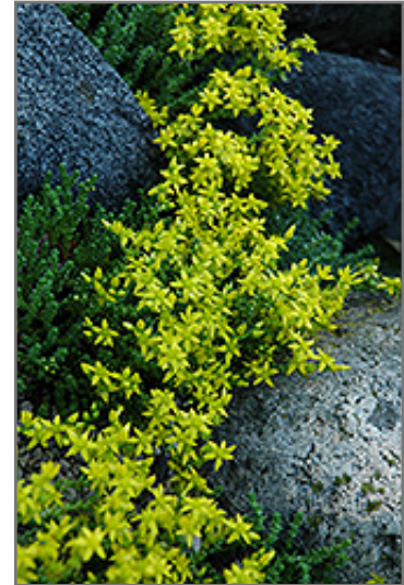
Six Row Stonecrop flowers