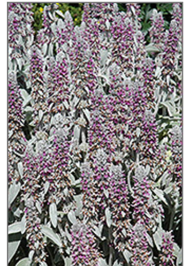
Lamb's Ears flowers