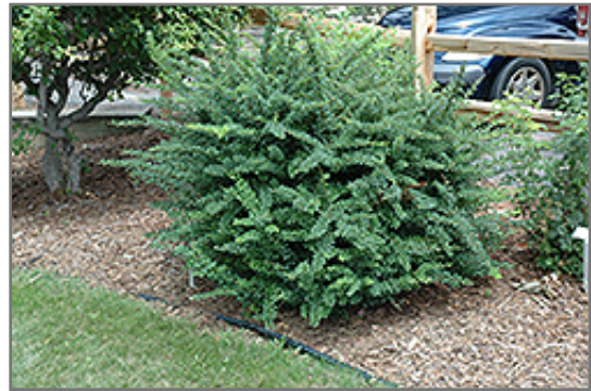
Jade Carousel Japanese Barberry

Jade Carousel Japanese Barberry will grow to be about 3 feet tall at maturity, with a spread of 4 feet. It tends to fill out right to the ground and therefore doesn't necessarily require facer plants in front. It grows at a medium rate, and under ideal conditions can be expected to live for approximately 20 years.