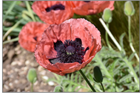
Princess Victoria Louise Poppy flowers