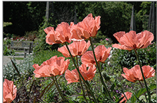
Princess Victoria Louise Poppy flowers