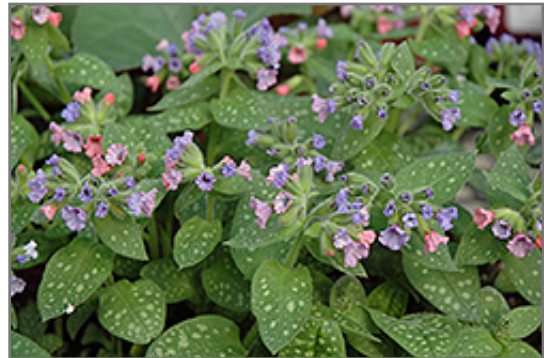
Mrs. Moon Lungwort flowers

Other Names: Lords And Ladies, Bethlehem Sage