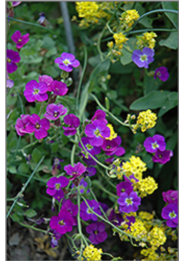
Whitewell Gem Rock Cress flowers