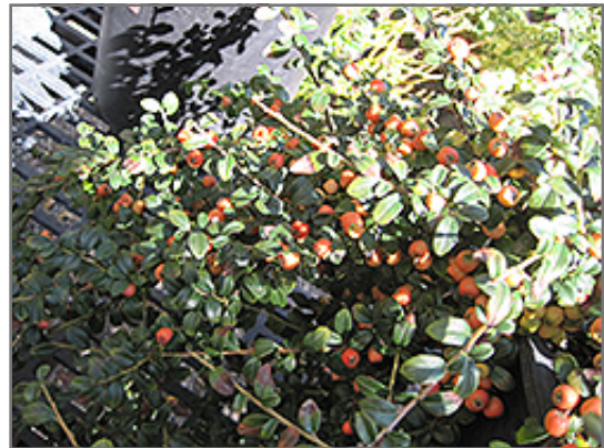
Lowfast Cotoneaster fruit