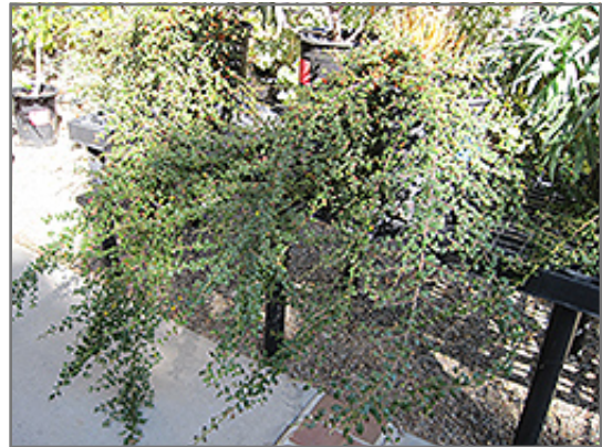
Lowfast Cotoneaster

Lowfast Cotoneaster is recommended for the following landscape applications;