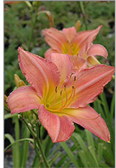
Corryton Pink Daylily flowers