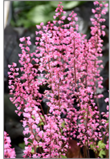
Dayglow Pink Foamy Bells flowers

Dayglow Pink Foamy Bells is a fine choice for the garden, but it is also a good selection for planting in outdoor pots and containers. It is often used as a 'filler' in the 'spiller-thriller-filler' container combination, providing a mass of flowers and foliage against which the larger thriller plants stand out. Note that when growing plants in outdoor containers and baskets, they may require more frequent waterings than they would in the yard or garden.