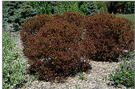
Summer Wine Ninebark