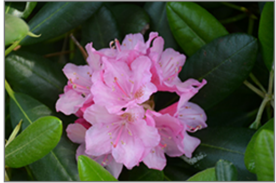
Helsinki University Rhododendron flowers

Helsinki University Rhododendron is recommended for the following landscape applications;