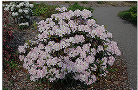
Helsinki University Rhododendron in bloom