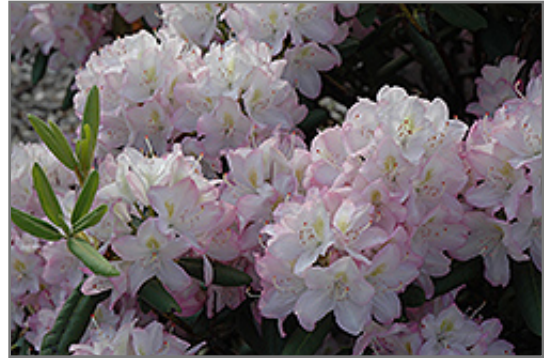
Helsinki University Rhododendron flowers

Helsinki University Rhododendron makes a fine choice for the outdoor landscape, but it is also well-suited for use in outdoor pots and containers. Because of its height, it is often used as a 'thriller' in the 'spiller-thriller-filler' container combination; plant it near the center of the pot, surrounded by smaller plants and those that spill over the edges. It is even sizeable enough that it can be grown alone in a suitable container. Note that when grown in a container, it may not perform exactly as indicated on the tag - this is to be expected. Also note that when growing plants in outdoor containers and baskets, they may require more frequent waterings than they would in the yard or garden.