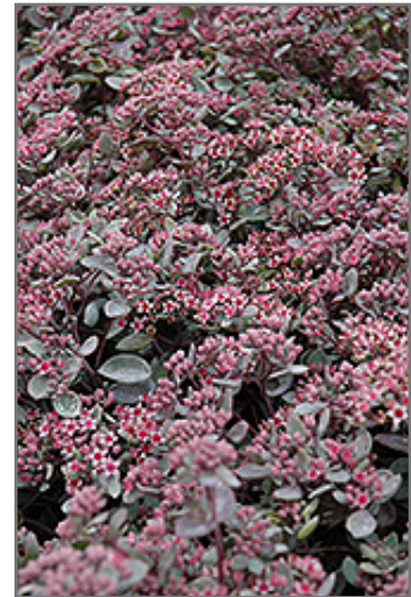
Vera Jameson Stonecrop flowers

A stunningly attractive perennial for hot, dry locations, featuring succulent bluish-green foliage and dark purple stems all season long, with showy pink flowers in late summer; a compact variety of stonecrop that also boasts excellent fall color