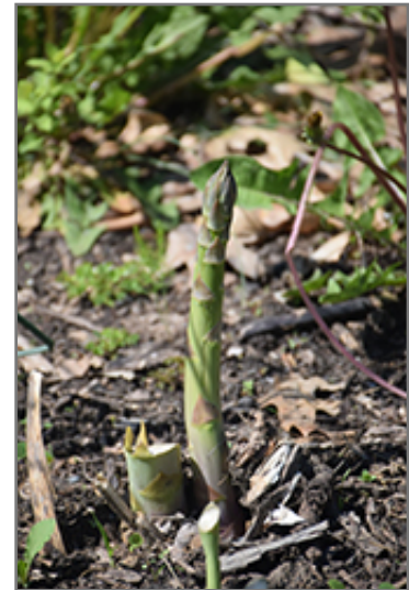
Jersey Giant Asparagus fruit