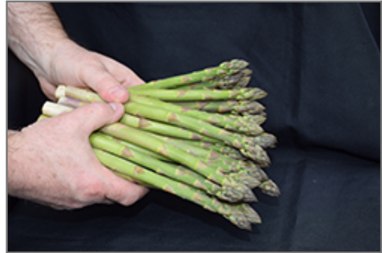
Jersey Giant Asparagus fruit

This plant is typically grown in a designated vegetable garden. It does best in full sun to partial shade. It does best in average to evenly moist conditions, but will not tolerate standing water. It is not particular as to soil pH, but grows best in rich soils. It is somewhat tolerant of urban pollution. This particular variety is an interspecific hybrid.