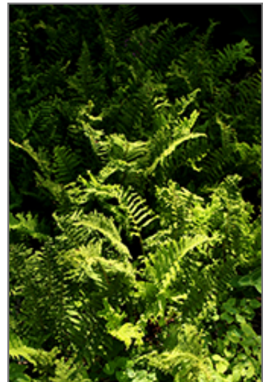
Lady Fern foliage