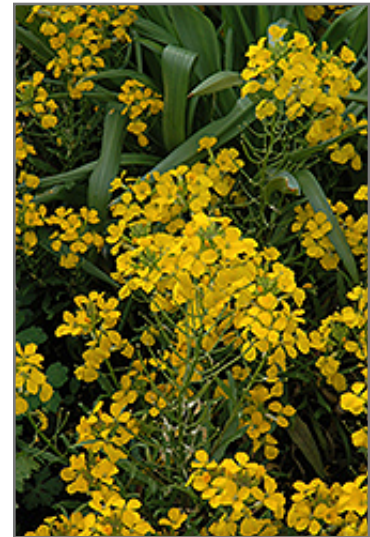
Citrona Yellow Wallflower flowers