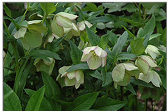
Christmas Rose flowers