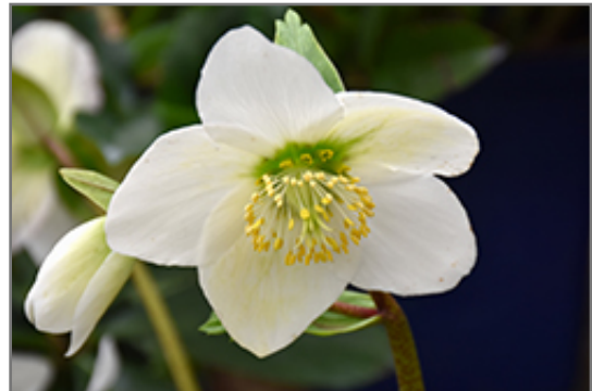
Christmas Rose flowers

Christmas Rose is recommended for the following landscape applications;