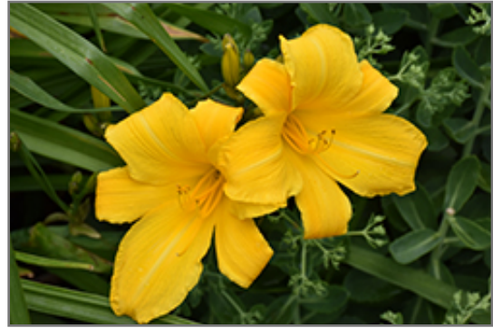
Buttered Popcorn Daylily flowers