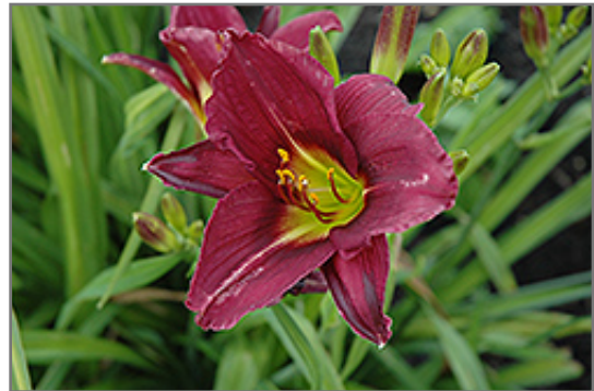
Baby Darling Daylily flowers