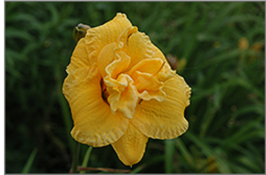
Double Dream Daylily flowers

Double Dream Daylily will grow to be about 30 inches tall at maturity, with a spread of 3 feet. When grown in masses or used as a bedding plant, individual plants should be spaced approximately 30 inches apart. It grows at a medium rate, and under ideal conditions can be expected to live for approximately 10 years. As an herbaceous perennial, this plant will usually die back to the crown each winter, and will regrow from the base each spring. Be careful not to disturb the crown in late winter when it may not be readily seen!