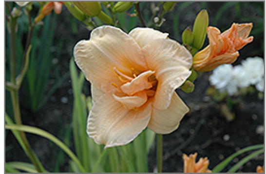
Bubbly Daylily flowers