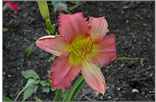
Chicago Petticoats Daylily flowers