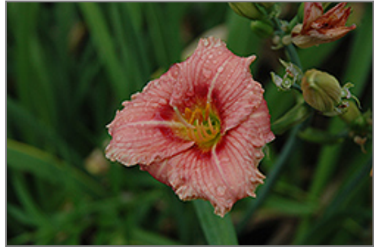
Siloam Bye Lo Daylily flowers