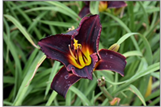
Salieri Daylily flowers