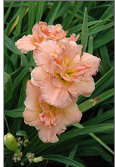
Siloam Double Classic Daylily flowers