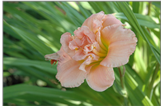
Siloam Double Delight Daylily flowers