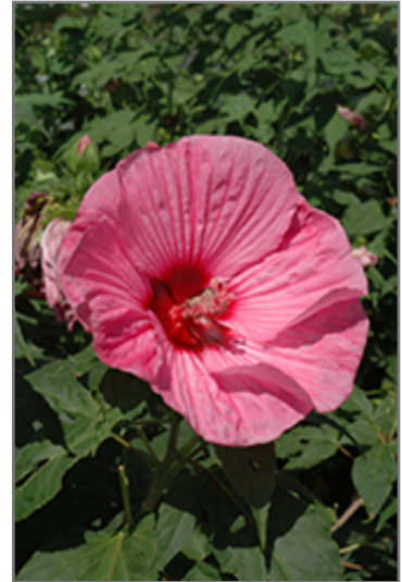
Plum Crazy Hibiscus flowers

This bold garden perennial features showy ruffled, lavender-pink flowers w/dark-red eye; attractive, glossy, large, dark-green/bronze leaves; ideal for the mixed garden border or in mass; do not allow to dry to wilting point