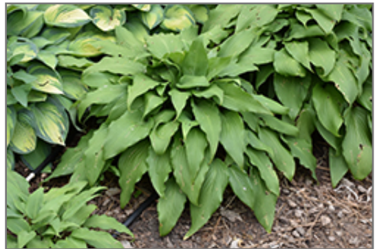
Red October Hosta