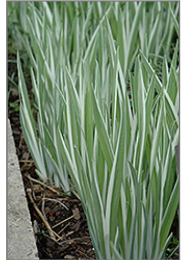
Variegated Japanese Flag Iris

Variegated Japanese Flag Iris is recommended for the following landscape applications;