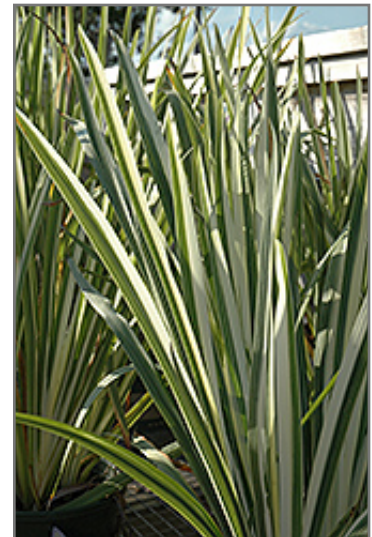
Variegated Japanese Flag Iris foliage