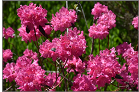
Landmark Rhododendron flowers