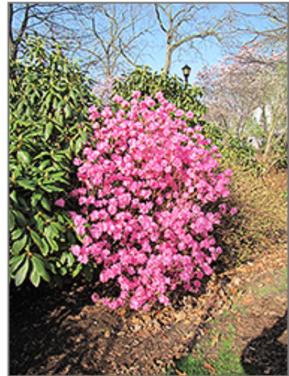
Landmark Rhododendron in bloom