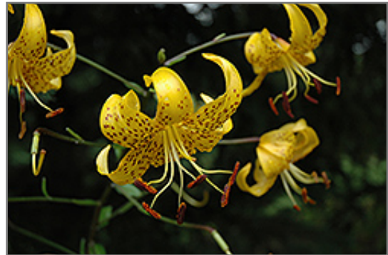
Turk's Cap Lily flowers