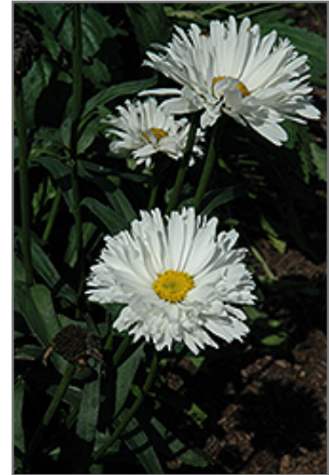
Crazy Daisy Shasta Daisy flowers

Crazy Daisy Shasta Daisy is recommended for the following landscape applications;