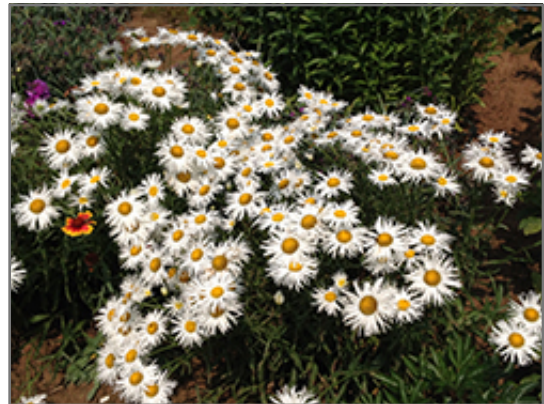
Crazy Daisy Shasta Daisy in bloom