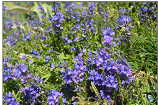
Goldwell Creeping Speedwell flowers