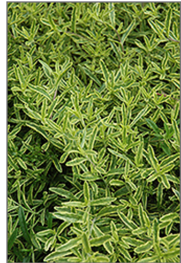
Goldwell Creeping Speedwell foliage

Goldwell Creeping Speedwell is recommended for the following landscape applications;