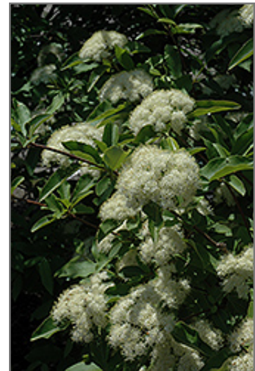
Witherod Viburnum flowers