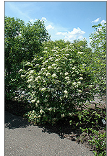
Witherod Viburnum in bloom