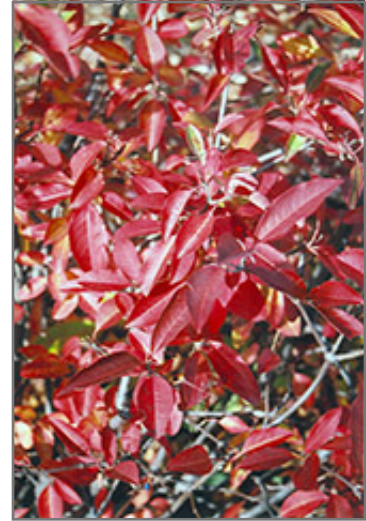
Witherod Viburnum in fall

This shrub does best in full sun to partial shade. It prefers to grow in average to moist conditions, and shouldn't be allowed to dry out. It is not particular as to soil type or pH. It is somewhat tolerant of urban pollution. This species is native to parts of North America.